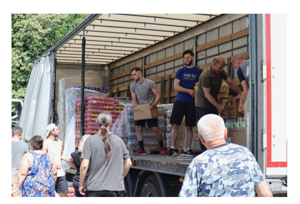
Unloading aid in Lviv.