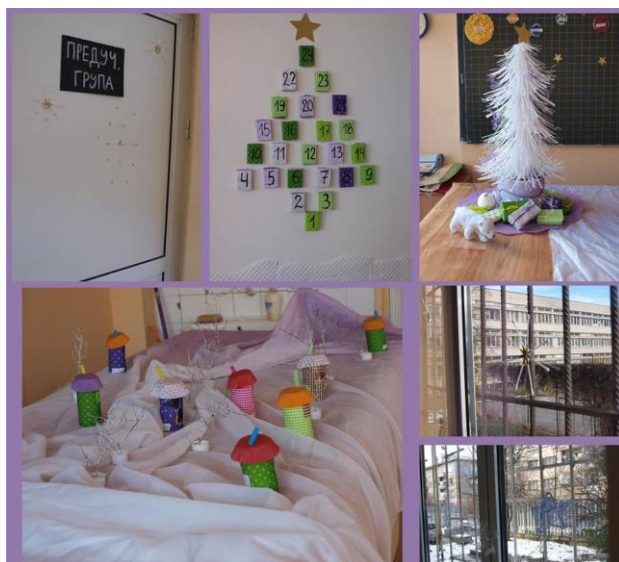
БЯЛА КОЛЕДА в Предучилищен клас