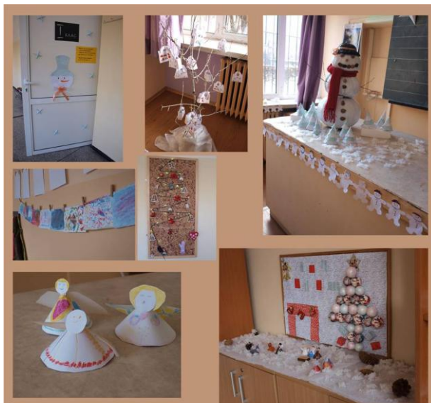
БЯЛА КОЛЕДА в I-ви клас

Christmas is also a great time to show appreciation and love, so we wanted to use this opportunity to express our gratitude towards our teachers. They have been faithful, loving, and devoted to their work and the kids. We really want to emphasize how much we appreciate their continuing dedication and professionalism and especially because we cannot yet provide the salaries that they deserve. In this regard, we are very thankful, first to the Lord, and also to our generous donors, who helped us give all our teachers Christmas bonuses. The parent committee also encouraged parents to raise some funds for a special Christmas celebration in honor of our teachers.