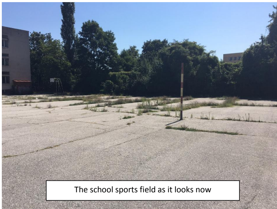
The school sports field as it looks now

In the last years in Bulgaria a scary tendency has been developing – young kids being overweight and living a non-active life. More and more kids prefer to stay in front of the computers instead of playing outside. Even the Government started putting efforts in resolving this problem by increasing the number of mandatory sports lessons.